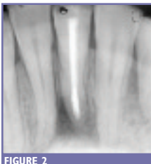
FIGURE 2 Immediate post-op

The root apex was retro-filled using IRM (a zinc oxide-eugenol intermediate restorative material, Dentsply Caulk). DynaGraft-D™ (Keystone Dental, Inc., Burlington, MA) was used to augment the periapical surgical site. DynaGraft-D™ is a bio-assayed DFDBA in a gel that stiffens in-situ. With simple instrument or finger manipulation, the material can be molded to augment the deficient periapical area. Once in position, the viscosity of DynaGraft-D™ reduces the risk of migration during final placement, irrigation and flap closure. Because DynaGraft-D™ is a demineralized bone graft material, immediate post-operative radiographs will show the augmented site as radiolucent (FIGURE 2). The radiographs will appear more radiopaque as the bone augmentation material turns over into new, vital, mineralized bone in the short term (2-4 months).