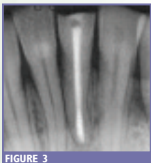
FIGURE 3 Three months post-op

The patient was prescribed post-op medications: Clindamycin 150mg qid for 10 days, Peridex mouth rinse bid for 30 days and Tylenol 3 q4h as needed for pain.