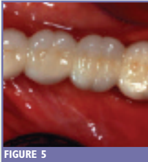
FIGURE 5 Final restoration

Healing was uneventful and the implants were uncovered at 9 months. Clinical evaluation confirmed the apparent regeneration of bone on the buccal aspect of the mandible with coverage of the exposed implants threads (FIGURE 4). At this time, the implants were stable and integrated and 3i's emergence profile transitional healing abutments were placed. A soft tissue healing period followed for the next 6 weeks. Prefabricated, preparable GingiHue™ Post (3i) prosthetic abutments were inserted and the patient restored with a ceramo-metal cemented fixed bridge (FIGURE 5).